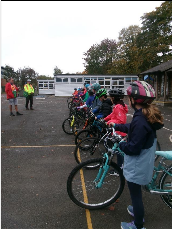
Year 5 enjoyed their Bikeability course.