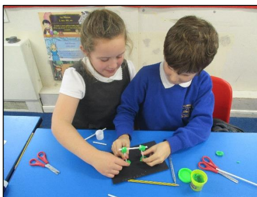
Children in Year 3 class enjoyed making shadufs in their DT lesson.